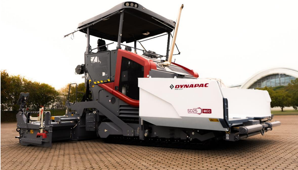
Caption: SD25 80C