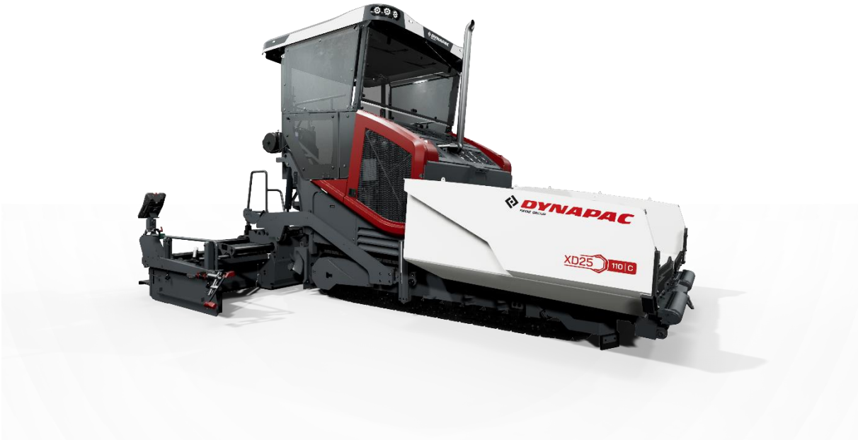
Caption: XD25 110C Flagship Paver