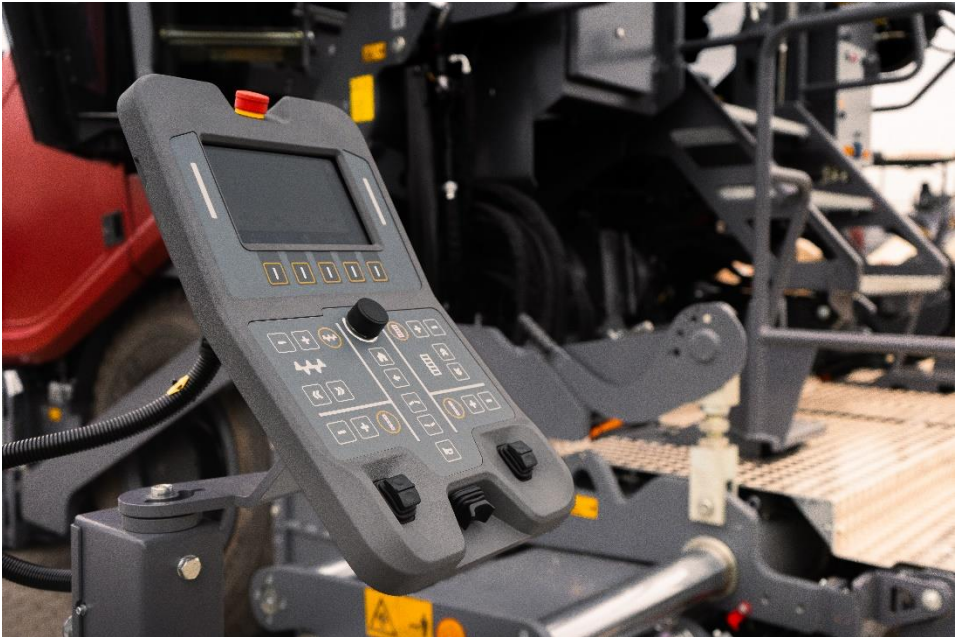
Caption: SD25 80C Level Control