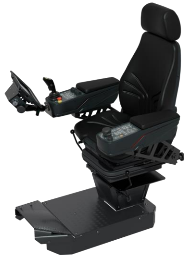
Caption: XD Series Swing Seat tracked Paver