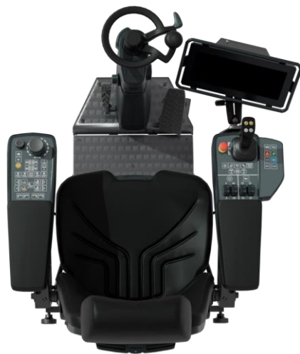
Caption: XD Series Swing Seat wheeled paver